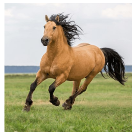
This year is the year of the Horse.

Chinese New Year officially begins on 17th February 2026.