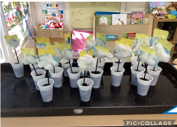
We cut out castles for our beanstalks.