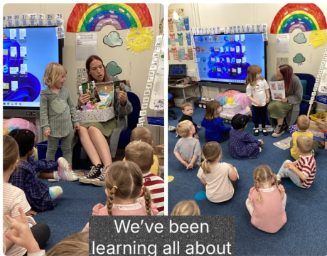
We've been learning all about each other this week.